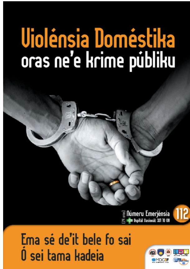
Figure 2: The domestic violence postcard AND PSOTER WERE developed jointly between UNFPA, UNMIT and SEPI